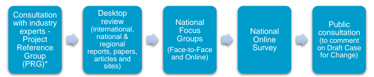
Note: A Project Reference Group (PRG) was established at the outset of the project and represents a broad range of Industry Reference Committees (IRCs) to ensure that all feedback and expert advice collected was inclusive and representative of industries across Australia.

A total of 234 responses from across 46 industries were received via the multiple channels established to collect feedback. Participants represented a range of stakeholders across industry and the VET sector, including employees and employers, government, associations and training providers. All state and territory locations were represented as well as a very broad range of industries, including Business, Health, ICT and Agriculture.